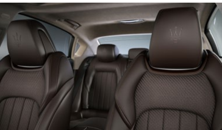
Quattroporte - Headrest detail