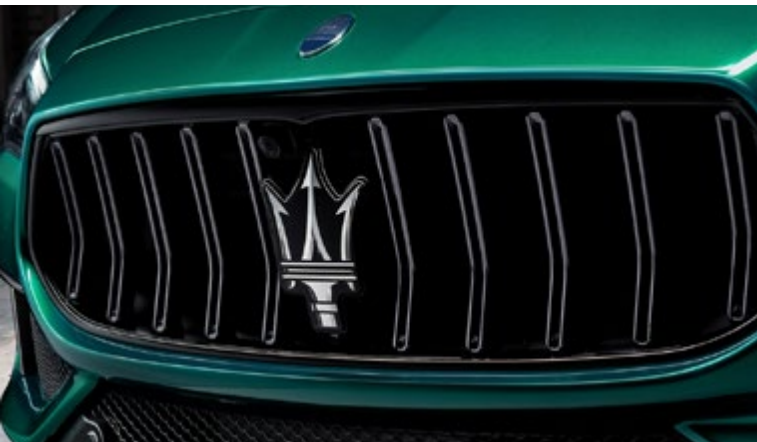
Quattroporte Trofeo - Grille

The fastest, the finest. The powerful icon that is the Quattroporte takes luxury grand touring to unprecedented levels of performance. For those who belong in the fast lane of exclusivity.