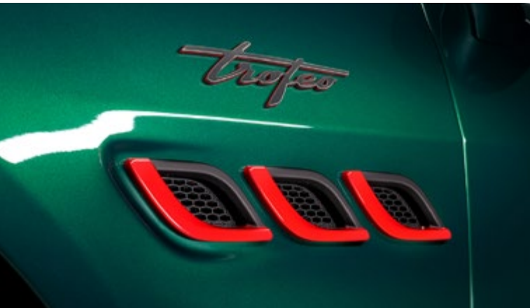
Quattroporte Trofeo - Side air vents and Trofeo Badge