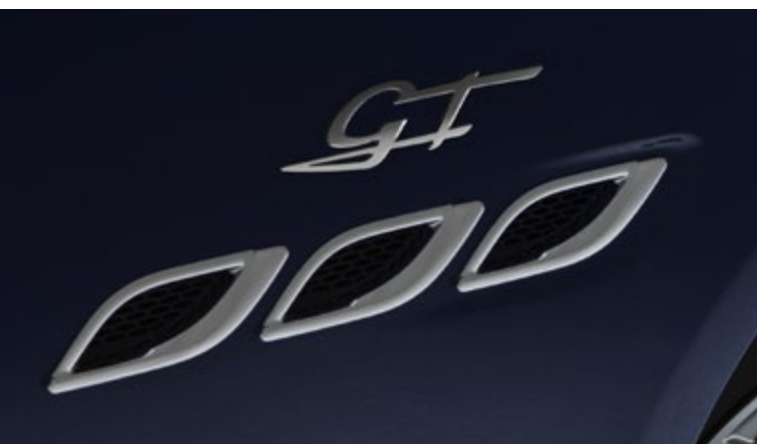
Quattroporte - Side air vents and GT Badge

The Quattroporte offers a combination of inspirational, high-capacity power and high-end business-like intelligence. So while it performs like a track-ready supercar, it's also remarkably efficient. Luxury, scale and space meet phenomenal dynamic capabilities in the Maserati Quattroporte – and it's all perfectly expressed by its stately yet dynamically intense exterior. With a perfectly balanced weight distribution, standard Skyhook suspensions, Brembo dual-cast brakes, the Quattroporte blend phenomenal dynamics with absolute comfort and safety.