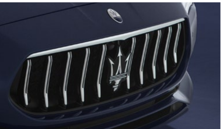
Quattroporte - Grille