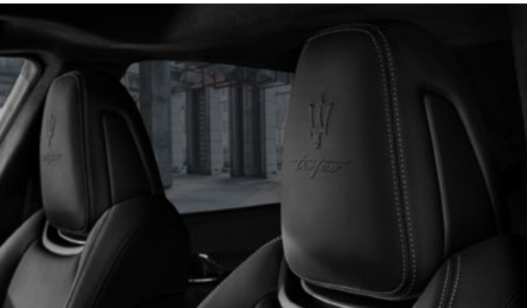
Quattroporte Trofeo - Headrest detail